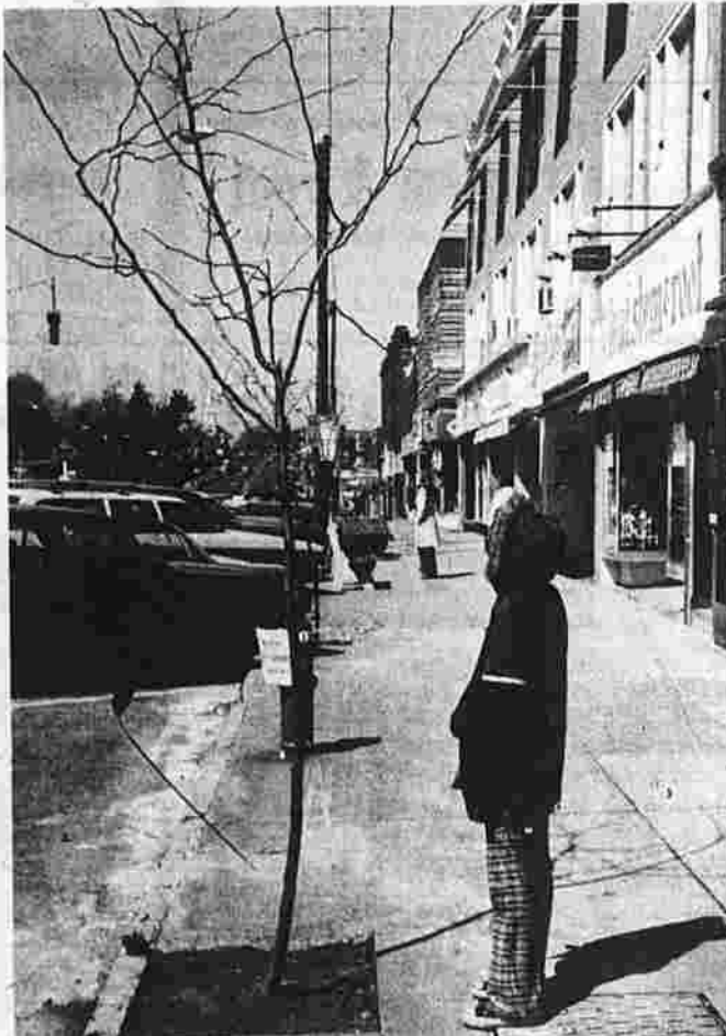
Looking for the first leaf

Hiring of the three new patrolmen completes the effort to fill vacancies in the police department which had remained unfilled for some time in a