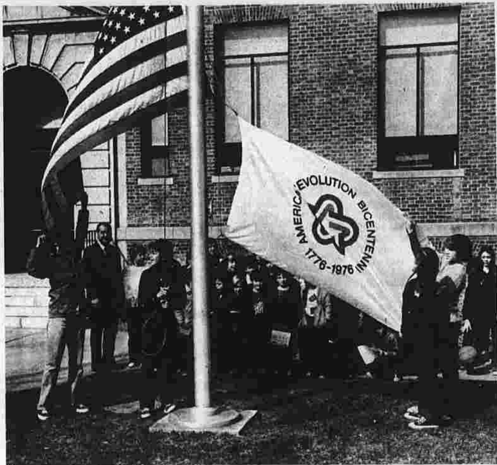
Flag raising at Nathan Hale School